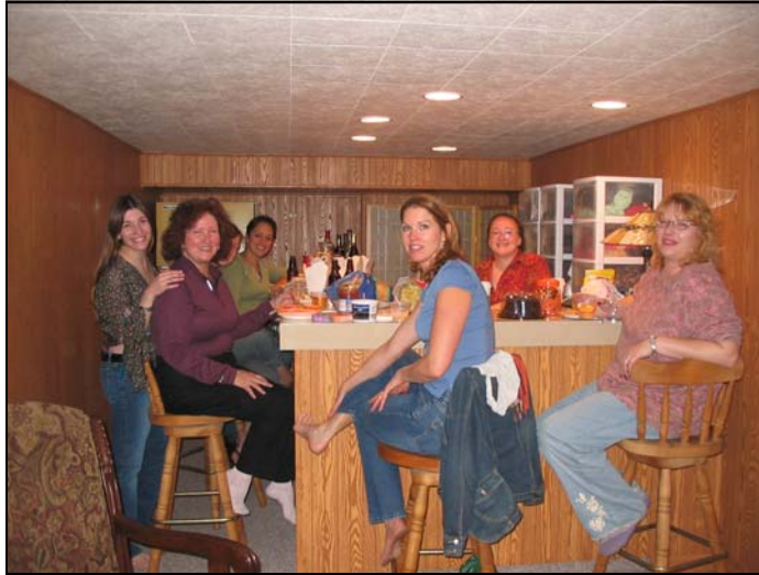
First a feast for the eyes, then a feast for the belly!